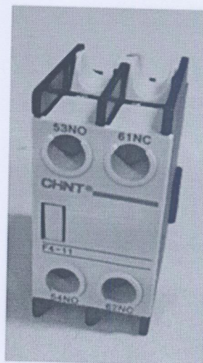
Images of F4 series