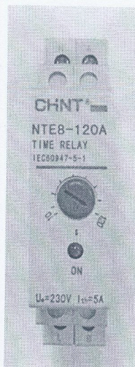
Images of NTE8