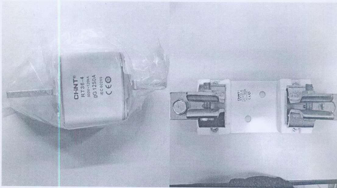
Images of RT36 series

Signed for and on behalf of Zhejiang CHINT Electrics Co., Ltd. — Chint Industrial Zone, January 14, 2017