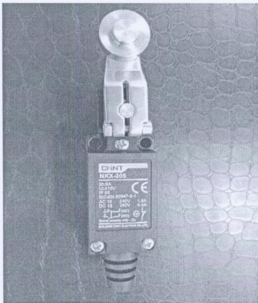
Images of NKX-2 series