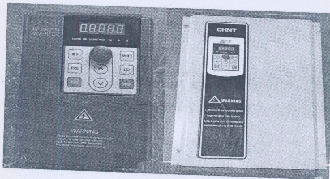
Images of NVF300 series

Signed for and on behalf of Zhejiang CHINT Electronics Co., Ltd. — Chint Industrial Zone, January 14, 2017